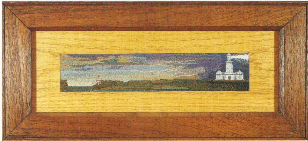
Sydney Heads & Environs: A Distanced View, 1987