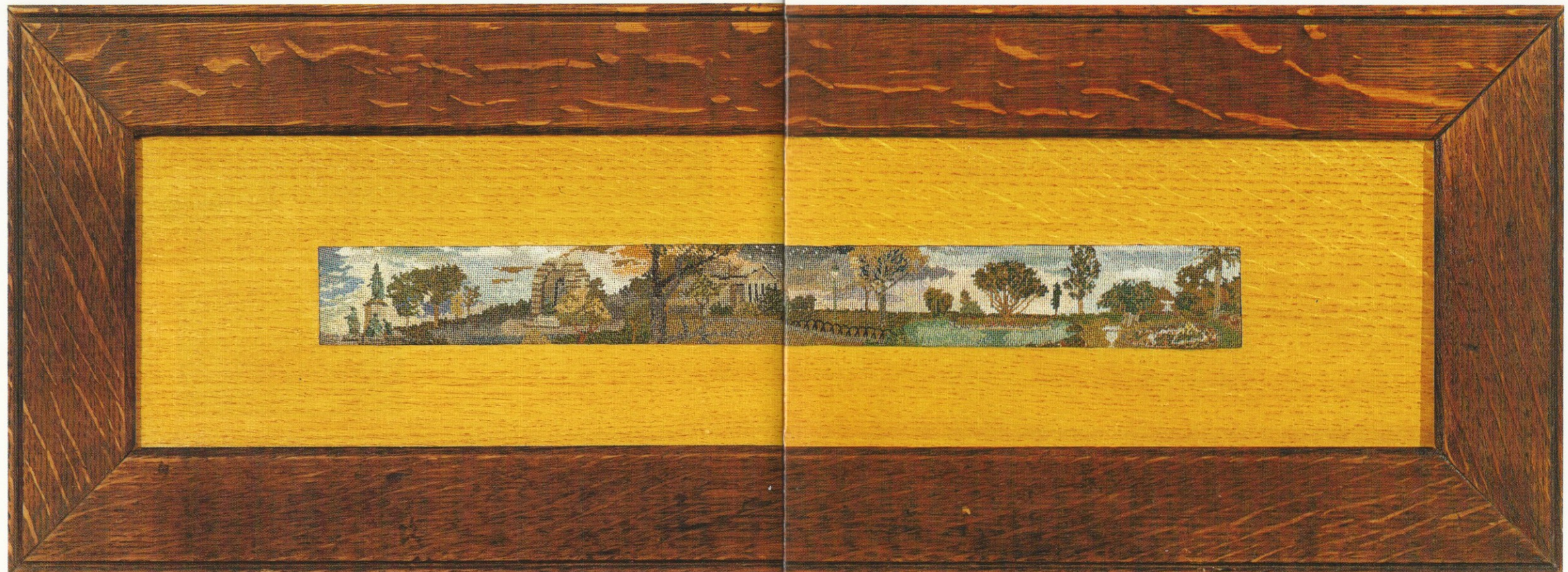
North Terrace & Environs: A Distanced View, 1987