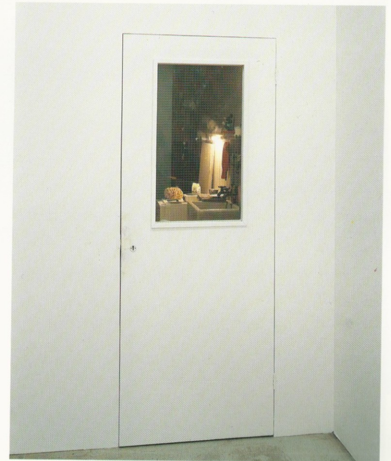
PETER FISCHLI / DAVID WEISS